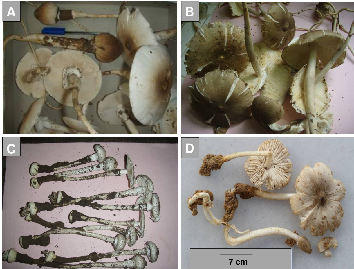
Figure 1: Termitomyces fruit bodies occurring in the study area. A: Termitomyces letestui ; B: T.cf euhizus ; C: T. fuliginosus and D: T. medius

sauces), to be eaten with rice and pounded plantain banana, yam or cassava.