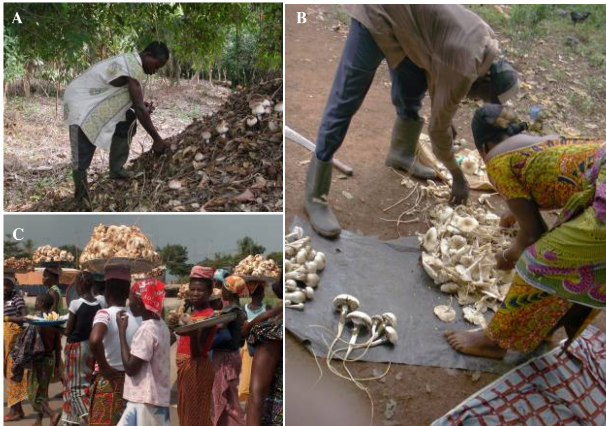
Figure 3: Actors of the harvest and trade of Termitomyces fruit bodies in central and southern Côte d'Ivoire. A: A business harvester collecting non-opened fruit bodies of Termitomyces letestui on a termite mound in the field. B: A business harvester selling his Termitomyces letestui fruit bodies to a rural small dealer near forest patches. C: Young girls and women (rural small dealers) selling large quantities of Termitomyces fruit bodies along the northward motorway (locality of N'Zianouan).

Actors' seasonal income: Seasonal income (i.e. February to April) of actors varies significantly according to the actors' category (Table 1). The highest average earnings for business harvesters have been observed in villages located in the semi deciduous forest (US$264.58±5.14 (N=7)), while those of the Guinean savannah reach only US$65.67±3.4 (N=4) (Table 1). No rural small dealer or wholesaler was observed in villages and markets of the Guinean savannah and in two villages