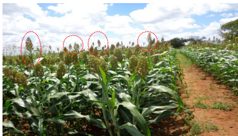
Figure 6: A sorghum Gadam field with stands of other sorghum varieties which were packed with the Gadam seeds. The plants (marked red) are of disproportionate height, (photo source: R. Mwadalu KU).

Seed systems and markets: The agricultural sector development strategy, 2010-2020 also noted that the decline in productivity of orphaned crops was partly arising from low use of improved seeds due to poor distribution systems and the monopoly of the Kenya seed company which concentrates its operations in high rainfall areas (GoK, 2010). The other major problem facing the sorghum subsector is the dominant position of the single market provided by East African breweries for the Gadam sorghum which is widely grown by farmers in the semi-arid eastern Kenya. Although EABL has helped to address the problem of marketing, it has led to a situation where farmers do not have an alternative market to sell their surplus produce or grains that do not meet the standards set by EABL. Cases of grains below standard have been encountered due to seed impurities especially mixing of varieties common with commercially supplied seed lots (Miano et al. , 2010).