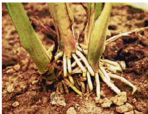
Figure 2: Photo showing secondary roots of sorghum.

such as roots of maize plants and thus confer an advantage in access of water and nutrients from soils (Republic of South Africa, 2010). Roots distribution and root system structure are both affected by soil moisture and play an important role in the plants ability to survive drought situations. Plants having the ability to increase root growth into regions with more available soil water have better chances of survival under drought situations, since increased root growth re-establishes the soil-root contact and facilitates water uptake (Abdulai, 2005).