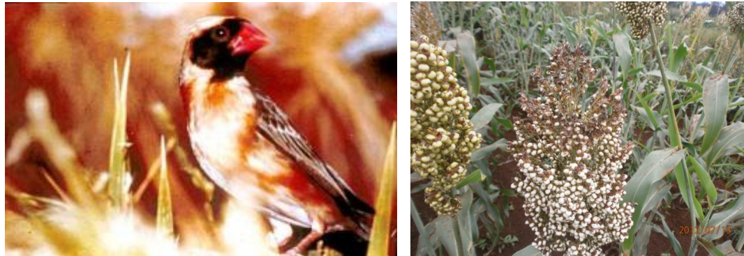
Figure 7: Red-beaked Quelea birds which feed on sorghum at the milking stage (left); Photo on the right shows Gadam sorghum head whose grain has been destroyed by Quelea birds.

important criterion for farmers to reject white sorghum varieties without tannin (Habindavyi, 2009). Other biotic constraints that cause high losses in sorghum cultivation include stem borer and Cercosporiosis.