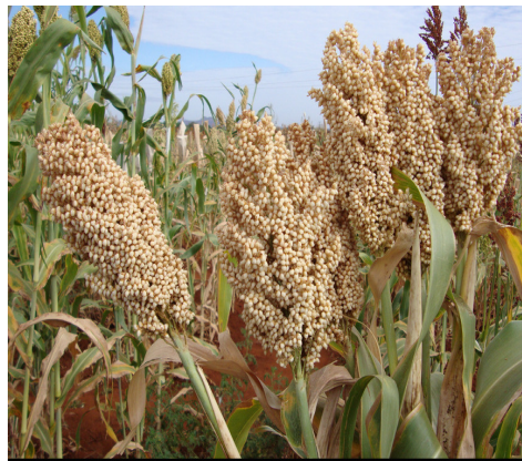
Figure 4: A photo showing Gadam sorghum, (left) and KARI Mtama 1 (right).