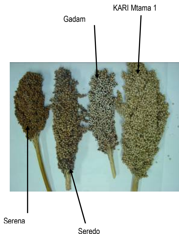
Figure 5: sorghum heads of the four most common sorghum varieties in Kenya, (photo source: KARI, 2006).