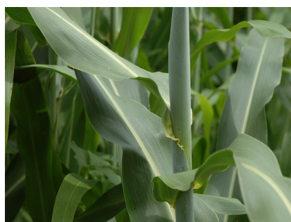
Figure 3: A photo showing sorghum leaves.

covered by a thin wax layer and develop opposite one another on either side of the stem. Environmental conditions determine the number of leaves, which may vary from eight to 22 leaves per plant.