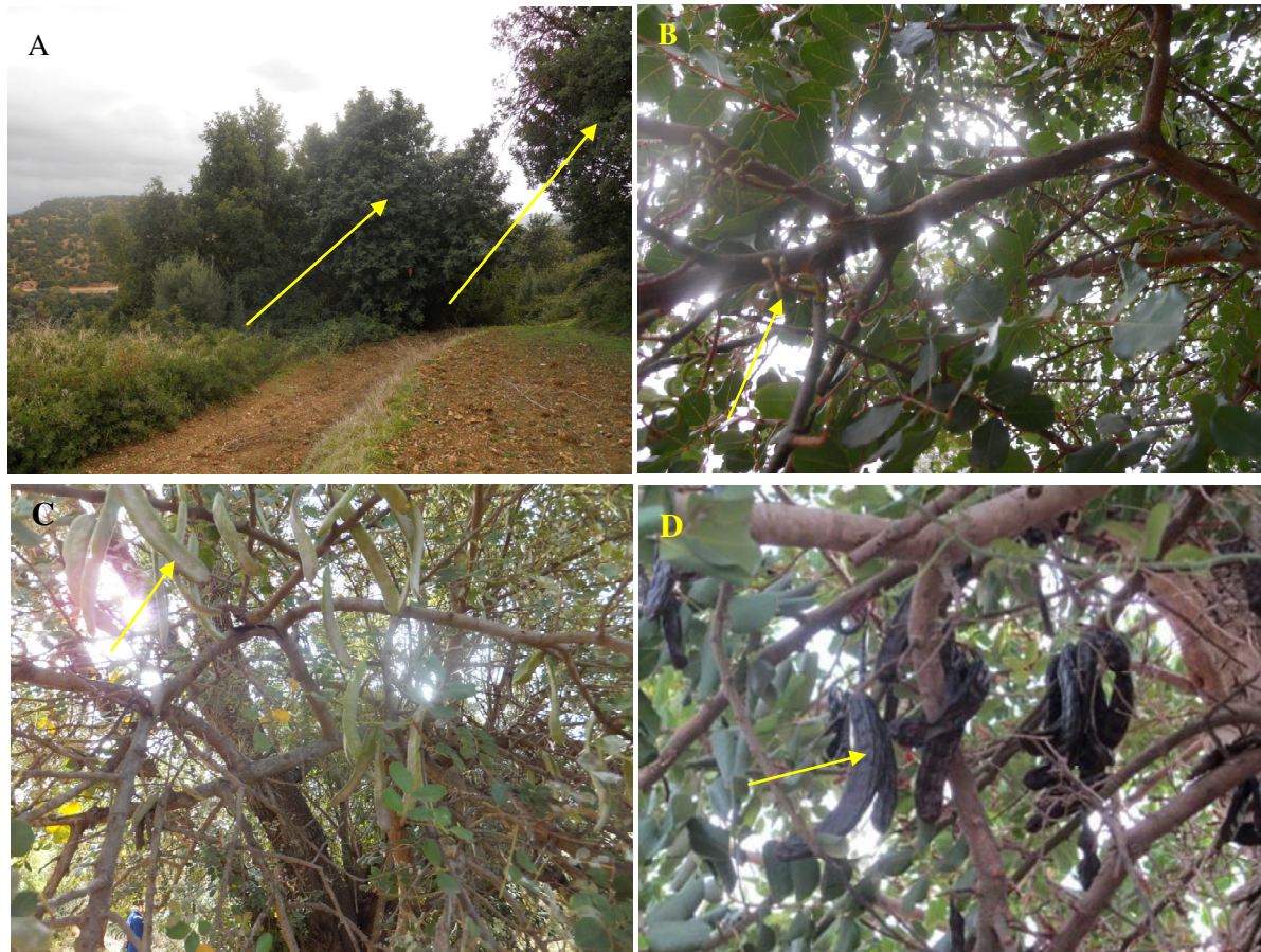
Fig. 1: Carob trees (A); flowers (B) and fruits (C and D).

has not had the attention it deserves in reforestation programs (Sbay et al. , 2005).