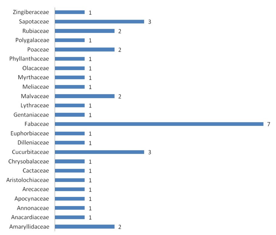
Fig. 2: Species count according to their families

Species count was highest in the family Fabaceae (n=7) while stem bark formed the most frequently used (32%) plant part. The results obtained in this study in terms of number of species in plant families and plant parts used are similar to that of Prasad et al. (2014) where the family Fabaceae had the highest species count, and roots and barks are the most frequently used plant parts in the cure of reproductive disorders in Wayanad district, Kerala. Particular emphasis should be given to the conservation of these plant parts. Unsustainable or indiscriminate harvesting of these parts could critically endanger, make vulnerable or worst still drive medicinal plants to extinction. Therefore, efforts should be directed at their sustainability using available conservation strategies and sustainable harvesting techniques. Some plant species in the genera Euphorbia and Lawsonia are