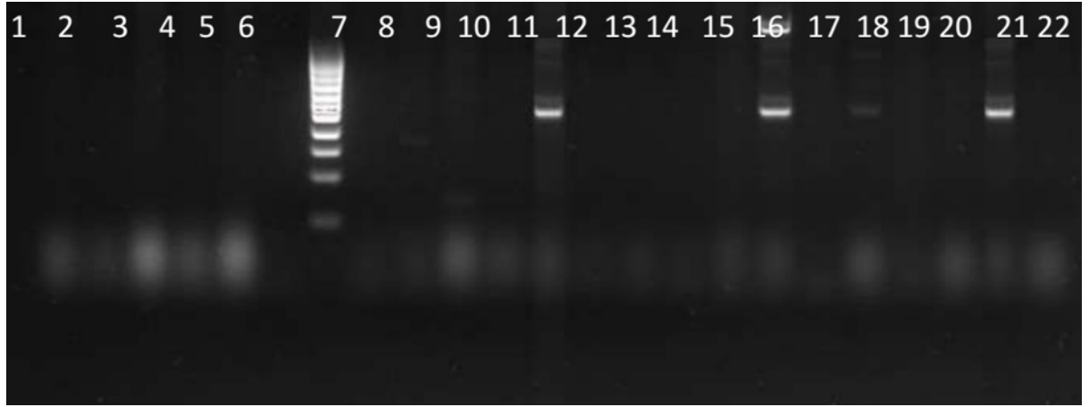
Figure 2: Detection of Stx1 gene in positive strains from agglutination test

Figure 1: Detection of eae gene in positive strains from agglutination test Legends: 1: E. coli S237, 2: E. coli S236, 3: E. coli S234, 4: E. coli S232, 5: E. coli S231, 6: negative PCR, 7: strain M1, 8: strain S1, 9: strain C1, 10 : strain C2, 11: strain FC, 12: strain M2 positive, 13: strain M3, 14: strain M4, 15: strain FP1 positive, 16: strain M5, 17: strain C3, 18: strain FS1 positive, 19:strain FP2, 20: strain FP3, 21: strain C4, 22: strain C5 positive, C= cattle; S= sheep; M= Milk; P= pig; F= faeces.