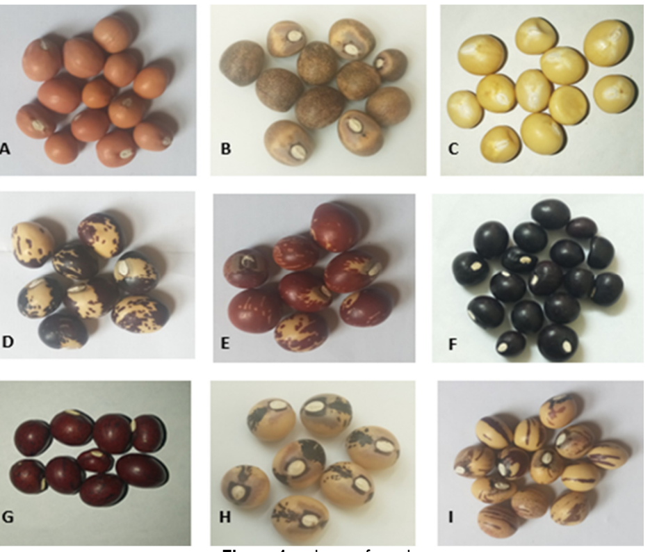
Figure 1: colours of seeds