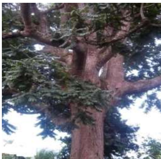
Figure 1: Canarium schweinfurthii tree

after softening by soaking in warm water. C. schweinfurthii fruits are traded throughout the distribution area of the species and even beyond. Traders buy these fruits in rural areas and sell them in main towns which are the major consumption centers (Njoukam and Peltier, 2002). Although statistics on trade flows are not available, ethno-botanic surveys have revealed that the market of C. schweinfurthii fruits significantly increases the income of those involved in its value chain (Tsewoue et al. , 2019; Traoré et al. , 2021). The leaves, the bark and the seeds are used in medicinal preparations for the treatment of various pathologies including dysentery, gonorrhoea, cough, stomach problems, skin diseases and high blood pressure (Koudou et al. , 2005; Okullo et al. , 2014; Tsewoue et al. , 2019). The wood and the resin from C. schweinfurthii are exploited for industrial and artisanal uses. Indeed, the wood is used for making veneer sheets, plywood, flooring, furniture. In some regions, it is used for the construction of canoes, troughs, planks and mortars. It is also used as fuelwood. The resin is sometimes used as candles, torches or as a smoke bomb to ward off mosquitoes. It is also used for repairing pots, clogging canoes and fixing arrowheads (Tchouamo et al. , 2000).