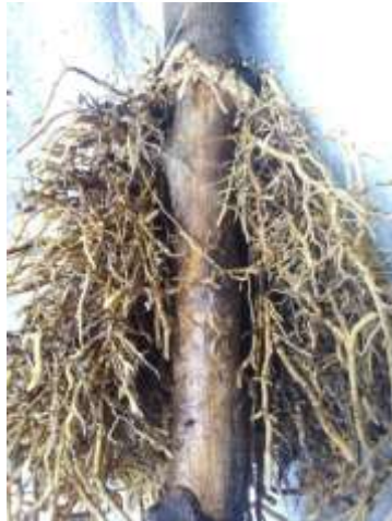
Figure 3: Rooted C. schweinfurthii 's marcot at six months after setting

The results of the analysis of variance (Table 1) showed that substrate and IBA concentration had significant effects on the percentage of rooted layers, whereas interaction of both factors had no significant effect. At six months after marcots setting, the cumulative percentage of rooted layers recorded with Topsoil substrate ( 32.98 \pm 4.87\% ) was lower than that recorded with either Sawdust ( 57.45 \pm 4.17\% ) or mixture of Topsoil and Sawdust ( 49.99 \pm 4.27\% ). These two last substrates were not different from each