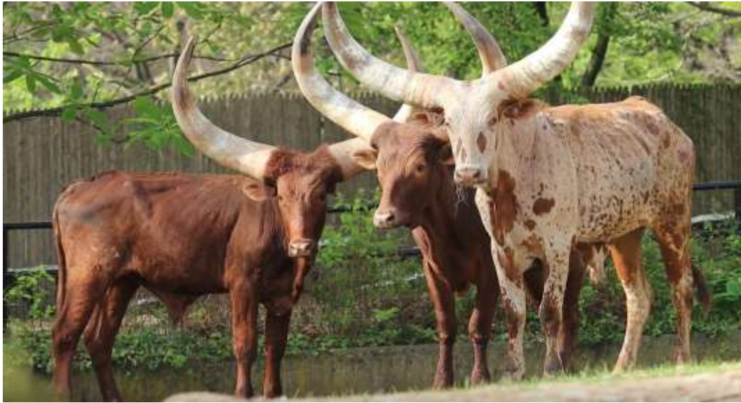
Figure 1 : Tutsi cows .

3.1.2 The territory of Kalehe: The territory of Kalehe, in its mountainous part in transition to the province of North Kivu, is an important region for cattle breeding. The climate of Kalehe is said to be warm temperate. The average temperature is 16.8 °C with a variation of 1.1 °C.