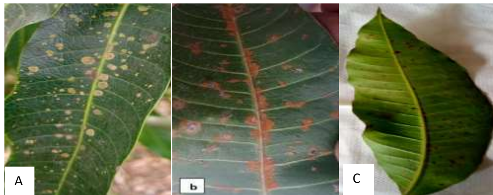
Figure 1: Symptoms of red rust on mango leaves; A: Symptoms on the upper surface; B: Symptoms on the midrib; C: Symptoms on the lower surface.

the vein (figure 1b). Infected leaves were mainly found in the basal part of attacked plants and generally on old leaves.