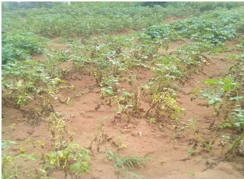
Plate 1: Severe symptoms of late blight disease on potato in Gicumbi district, Rwanda.

Same uppercase letters along columns indicate no significant difference between the potato varieties at the same location, while same lowercase letters across rows indicate no significant difference between the different localities for each variety at \alpha = 0.05 according to the Tukey test. Scale description by Hansen et al. (2005): 0 (very of very low); 1 (very low); 2 (very low to low); 3 (low); 4 (low to medium); 5 (medium); 6 (medium to high); 7 (high); 8 (high to very high); 9 (very high).